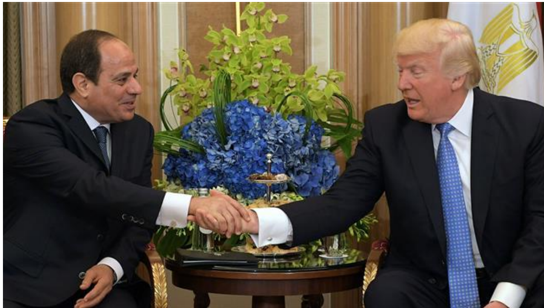
US President Donald Trump (R) and Egyptian President Abdel Fattah el-Sisi meet at a hotel in Riyadh, Saudi Arabia, May 21, 2017.

The decision made by of the administration of US President Donald Trump was surprising after he promised strong ties with the key US ally following a period of strain under former President Barack Obama.